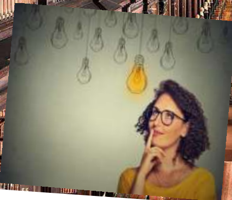
Questioning the main idea