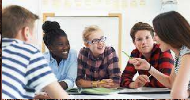
Classroom Discourses On Texts, Ideas, Questions