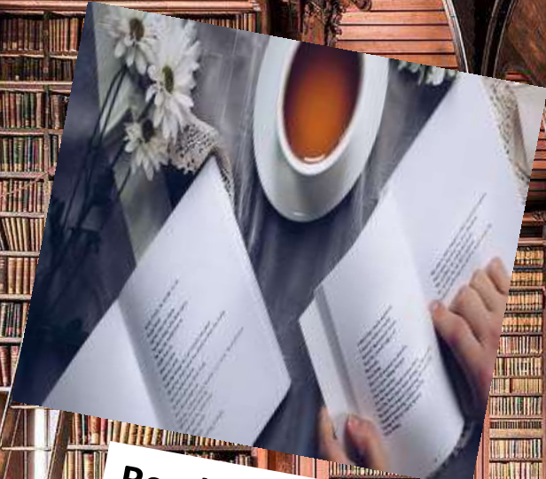
Reading a text